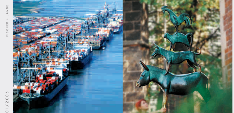
01 / 2006 FISCHER + LANGE

Kontorhaus am Markt Langenstrasse 2-4 (Entrance Stintbruecke 1) D-28195 Bremen Phone: ++49-(0)421 - 9600 - 10 Fax: ++49-(0)421 - 9600 - 810 mail@big-bremen.de www.big-bremen.com